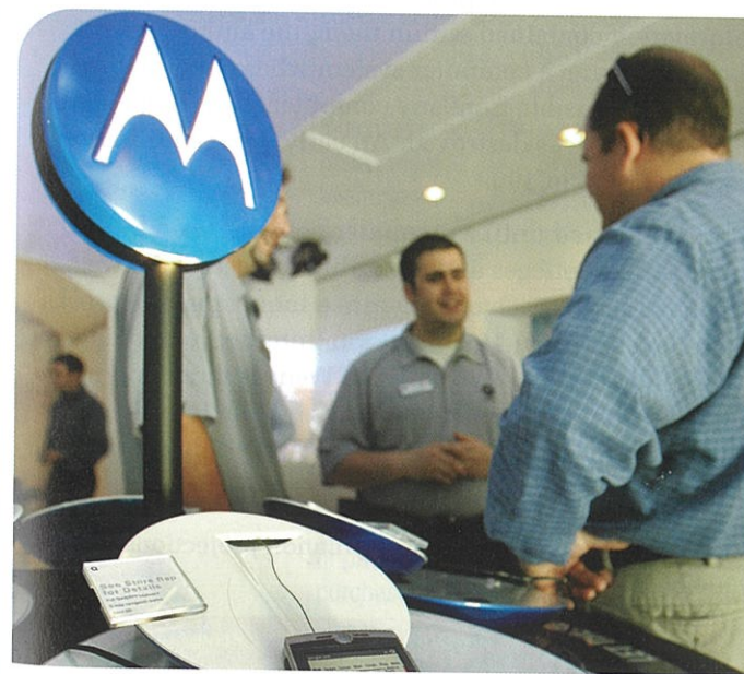
8.10 The Motorola retail store in Chicago, United States