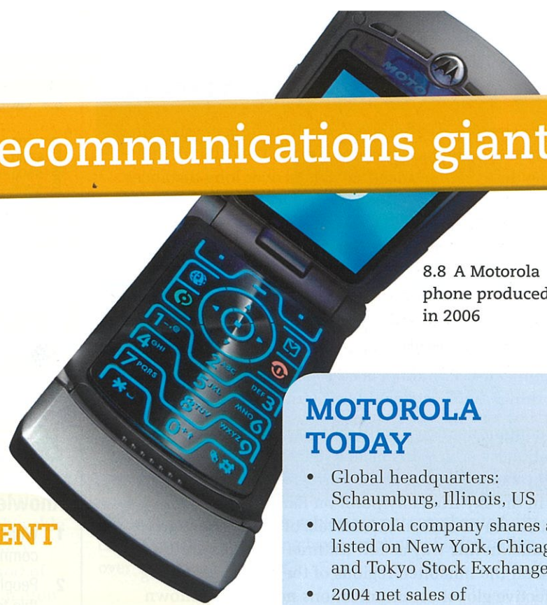
8.8 A Motorola phone produced in 2006